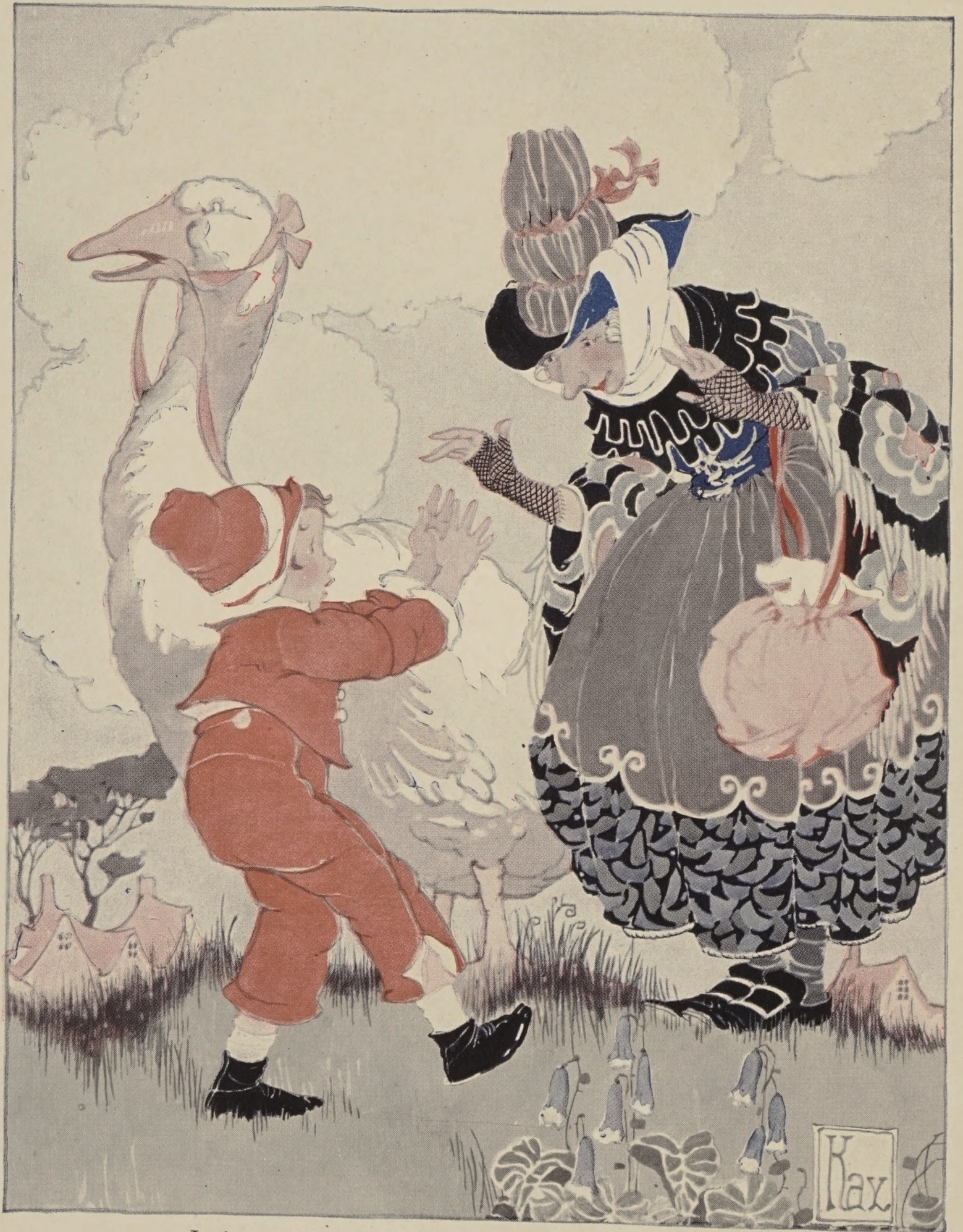
In just a minute, there she was on the ground beside him